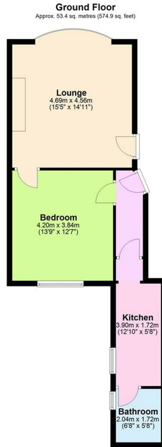
Total area: approx. 53.4 sq. metres (574.9 sq. feet)